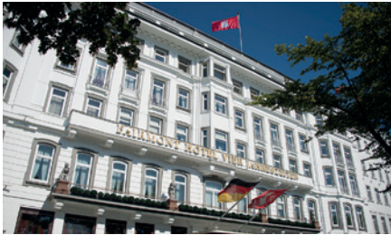
FAIRMONT HOTEL FOUR SEASONS HAMBURG, GERMANY