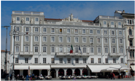
GENERALI INSURANCE HEADQUARTERS TRIEST, ITALY