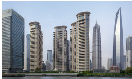
TOMSON RIVIERA APARTMENT TOWERS SHANGHAI, CHINA