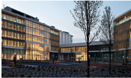
KONICA MINOLTA MILAN, ITALY