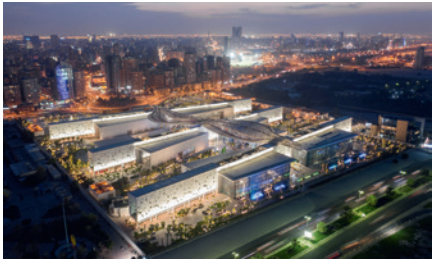
SHEIKH ABDULLAH AL SALEM CULTURAL CENTER, KUWAIT CITY