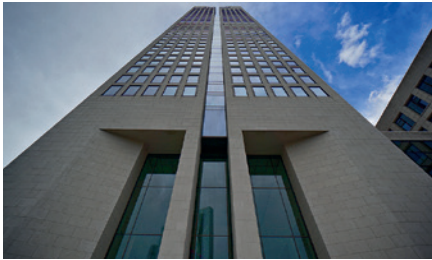
OPERA TOWER FRANKFURT, GERMANY