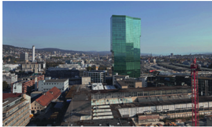
PRIME TOWER ZURICH, SWITZERLAND