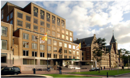
SHELL GLOBAL HEADQUARTERS THE HAGUE, NETHERLANDS