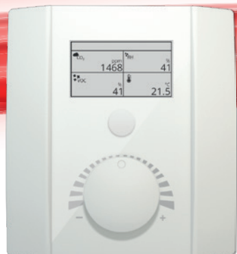
NOVOS 3 x (EPD)