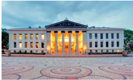
UNIVERSITY OSLO, NORWAY