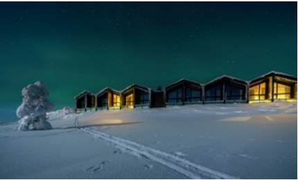
STAR ARCTIC HOTEL SAARISELKÄ, FINLAND