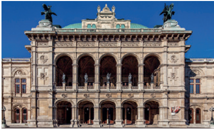
STATE OPERA VIENNA, AUSTRIA