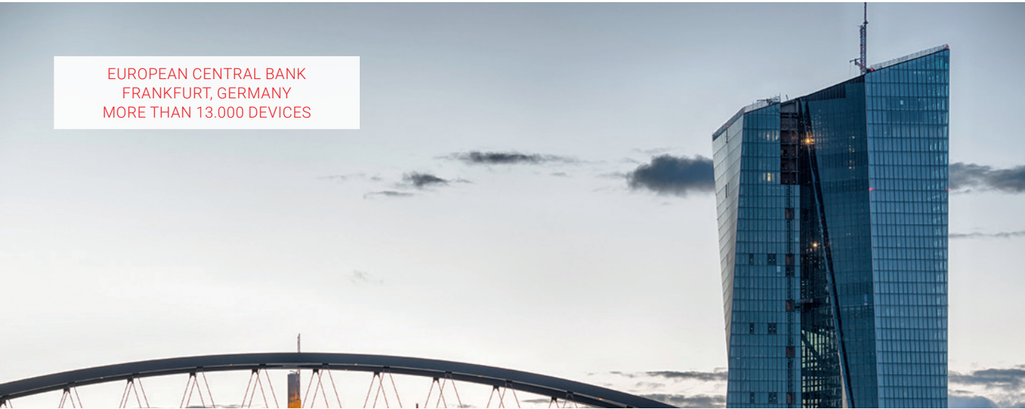
EUROPEAN CENTRAL BANK FRANKFURT, GERMANY MORE THAN 13.000 DEVICES