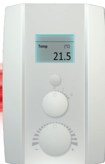
NOVOS 5 x Design