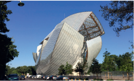
LOUIS VUITTON FOUNDATION PARIS, FRANCE