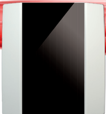
NOVOS 3 SR CO2